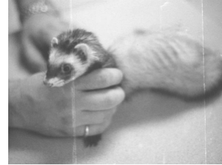
Adrenal disease is the most common cause of hair loss.

Treatment options can be discussed if problems are detected.