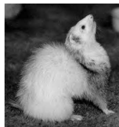
Revolution is effective for preventing both fleas and heartworms.

3 drops once monthly for ferrets over 1 kg.