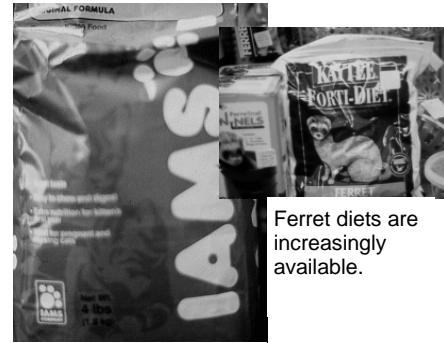
Ferret diets are increasingly available.

Ferrets should be fed free choice. Although a ferret may carry a large amount of fat, obesity as a clinically relevant disorder is extremely rare in ferrets. High fiber diets intended for weight loss in cats should not be used in ferrets.